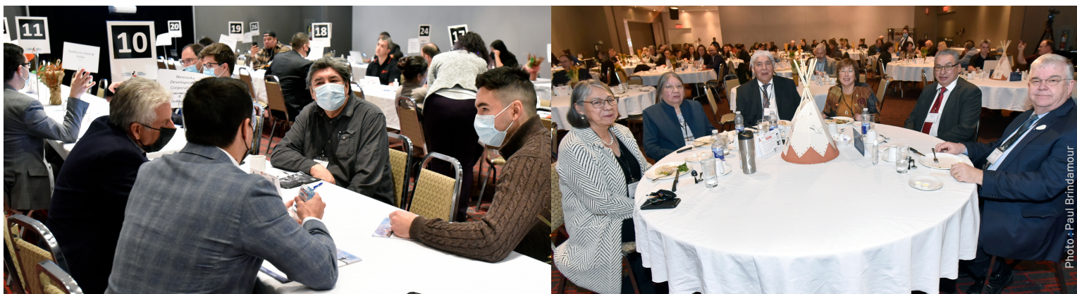
Nearly 300 planned business meetings were organized in person and virtually on the Allia platform.

Once again, this year the Secretariat's Business Exchange Day was a remarkable success. Dedicated to the creation of links between businesspeople from the regions of Eeyou Istchee, Jamésie, Abitibi-Témiscamingue and Nunavik, this Day annually marks the meeting of entrepreneurs, decision-makers, and leaders of these four corners of the province. This event, which promotes the harmonious development of economic alliances, has once again stimulated mutual understanding and the desire to cooperate.