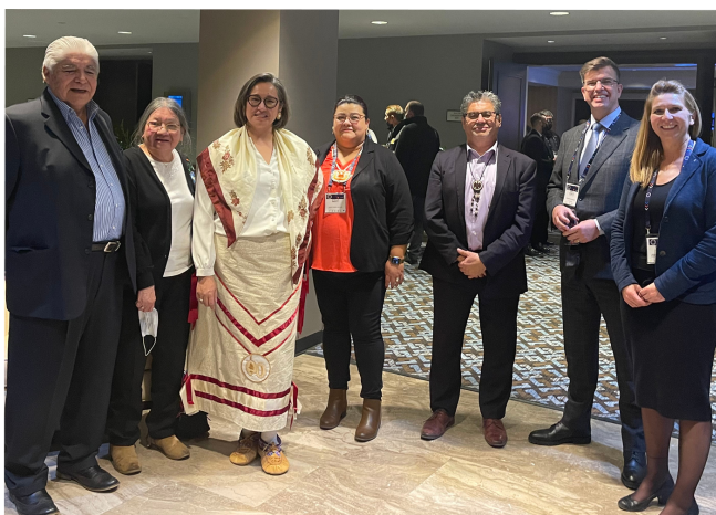
Great meetings, in person, were able to bring together the Secretariat team and the Grand Chief as well as members of her team at the Cree Nation Government.