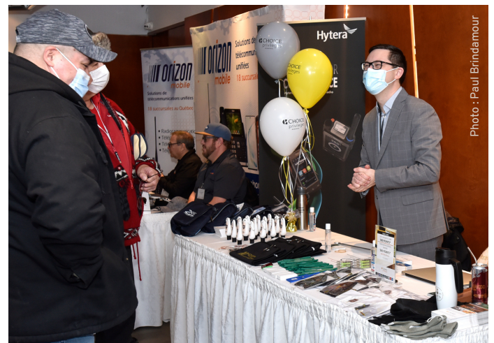
Several exhibitors from the region were on site to meet the participants. (In the photo, CREECO and Orizon Mobile kiosk)