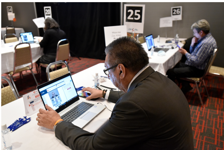
Participants were able to experience the very first hybrid formula at this 18th Edition of the Business Exchange Day on the Allia platform.