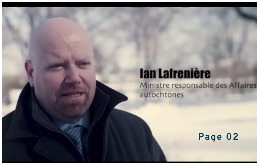
Ian Lafrenière Ministre responsable des Affaires autochtones