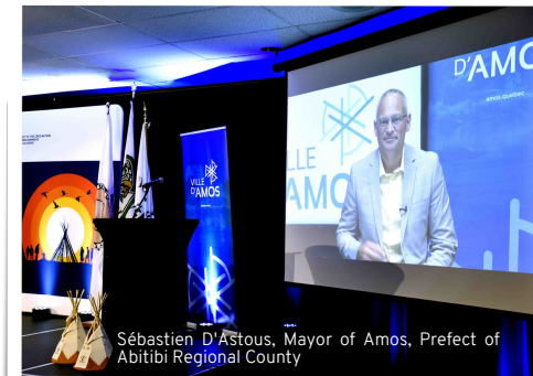
Sébastien D'Astous, Mayor of Amos, Prefect of Abitibi Regional County