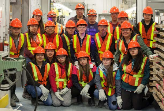
2017 Wemindji Students