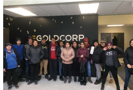
2018 Wemindji Students