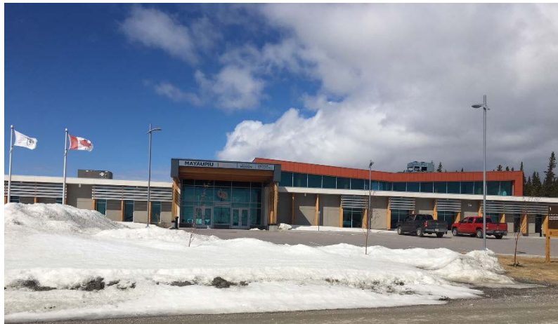
Mâyâupiu Training Institute, Wemindji

Establish and implement programs to promote training, employment and retention of the Crees in a manner that enables the integration and advancement .