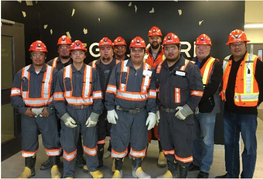
Vocational Training Mobile Mechanics